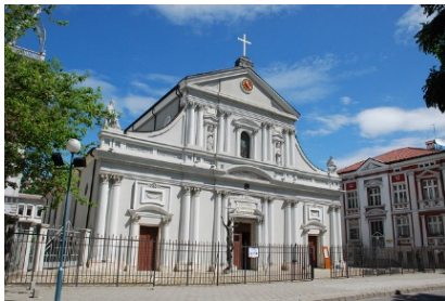
The Cathedral of St. Ludwig

Plovdiv traditionally is considered as one of the main centres of Bulgarian Armenian population and culture.