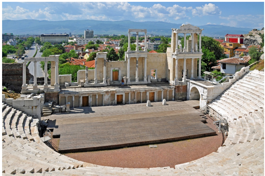
The Ancient Amphitheatre

Plovdiv, given different names during the centuries, has witnessed the history of the region and the Balkan Peninsula. It still keeps the ruins reminding us of the Thracians, the Romans, the Slavs, the Bulgarian State, the Byzantines and the Turks.