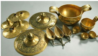
The Gold Treasure of Valchitran

Bulgaria is officially a member of the EU since 1st January 2007 and a full member of NATO.