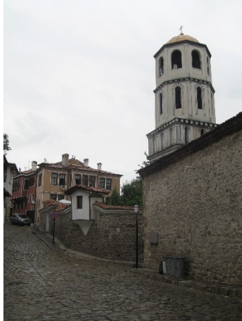
St. Konstantin and Elena Church in the Old Town of Plovdiv

the large province Thracia Romana and had its own Senate.