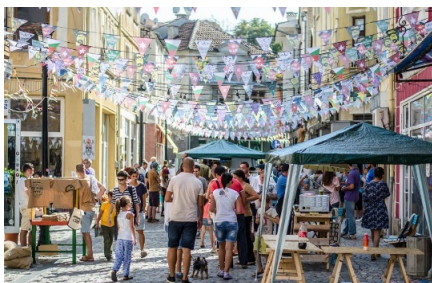
Kapana Art District: Here you will find craft shops, unique fashion and jewellery by local designers. It is full of bars, ateliers and festivals.

opera art. It has created an appropriate artistic climate for international guest producers and singers.