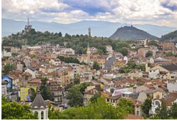
Plovdiv: General View

Plovdiv is the second largest city in Bulgaria, and an important commercial, cultural, scientific and transportation centre. It is one of the most popular tourist destinations in Bulgaria. Founded as a settlement around seven syenite hills, it is one of the most fascinating European towns. The favourable climate conditions as well as the good geographical location have contributed to its ascending development from the remote past until modern times. The town has preserved extremely valuable cultural monuments from the Antiquity, the Middle Ages and the Bulgarian Renaissance coexisting in harmony with contemporary culture.