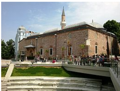
The Dzhumaya Mosque