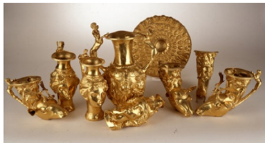
The Gold Treasure of Panagyurishte