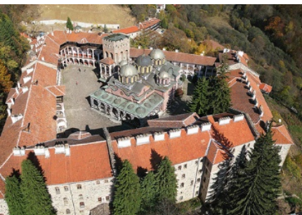
The Rila Monastery

Until recently, the Thracians were considered to be the oldest population inhabiting the Bulgarian lands. However, the discovery of the unique necropolis near the lakes of Varna, dating back to the 5th Millennium BC, cast a new light on that issue and brought forward new hypotheses. Over 3000 golden items found there gave reasons to a number of scholars to believe that the first European civilization originated on the shores of Varna lakes.