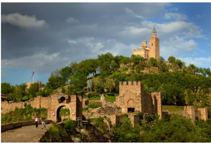
The Tsarevets Fortress in Veliko Tarnovo