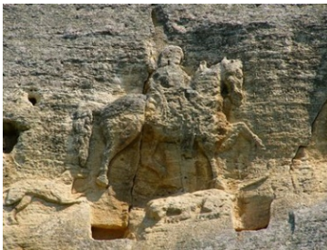
The Thracian Horseman near the village of Madara

Evidence of the life and craftsmanship of the Thracians was produced by the archaeological excavations and finds in Plovdiv, in the village of Starosel, in the town of Varna, etc. Numerous votive tablets with the figure of the Thracian Horseman near the village of Madara, as well as funeral masks, chain armours, chariots, utensils and decorations are found there. The Gold Treasure of Panagyurishte, the Gold Treasure of Valchitran and the Silver Treasure of Lukovit are among the most remarkable finds. The Thracian Tomb of Kazanlak is unique with its frescos.