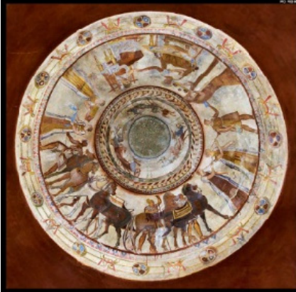
The Thracian Tomb near Kazanlak (a fresco)