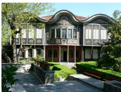
The Ethnographic Museum

Under today's downtown section of Plovdiv lie the ruins of an enormous Roman Stadium with a length of 180 m and with a capacity for 30, 000 spectators. Marble reliefs, pottery and other relics provide evidence of the Bulgarian influence in the city during the Middle Ages.