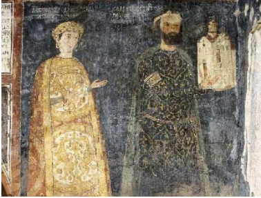
The Boyana church (a fresco)

Asen and Petar overthrew the power of Byzantium. As a result, the Second Bulgarian Kingdom was established, with Tarnovo as the capital city.